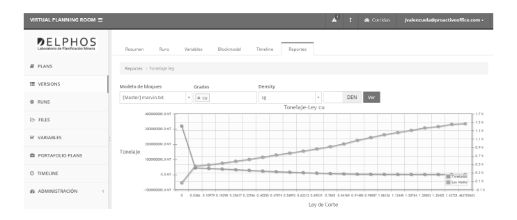
Figure 3: Visualization of a Ton-Grade curve on a test block model. The system allows to easily visualize the data on the system for any ore types included in a block model.

Figure 2: Timeline functionality that makes tracking to any change on the data use for one "run". The system even allows to track any change on columns on the block model. This is abled thought the implementation of a driver library that informs to the system how the data should be interpreted on the planner software (i.e.: Whittle [6], Doppler).