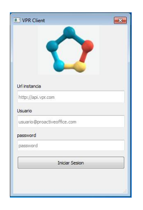
Figure 2: VPR client prototype wich is used to run on client computer in order to synchronize files and planner information while it run in background on the user laptop. VPR client uses the configuration already made on the web for privacy and planner program that is going to be used.